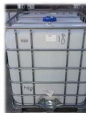
Identification plate missing